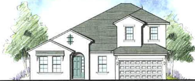
ELEVATION B - BONUS / BEDROOM #5