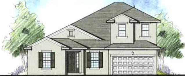
ELEVATION A - BONUS / BEDROOM #5