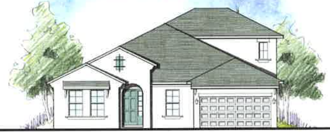
ELEVATION B - BONUS