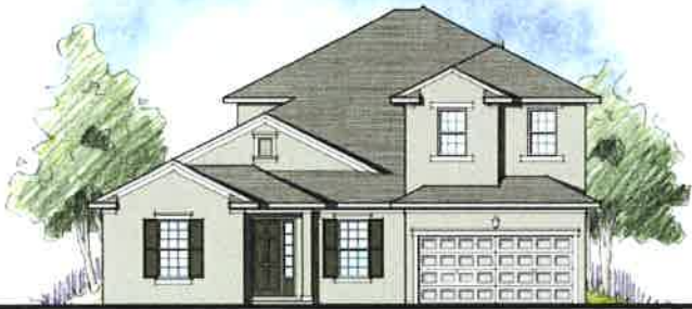
ELEVATION A - SUPER BONUS & BEDROOM #5/6

4 BEDROOM | 4 BATH | 2 CAR GARAGE • APPROX. 3,026 SQ. FT. LIVING AREA