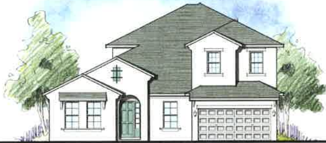
ELEVATION B - SUPER BONUS & BEDROOM #5/6