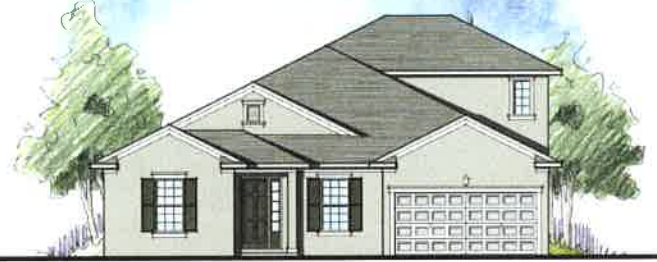
ELEVATION A - BONUS